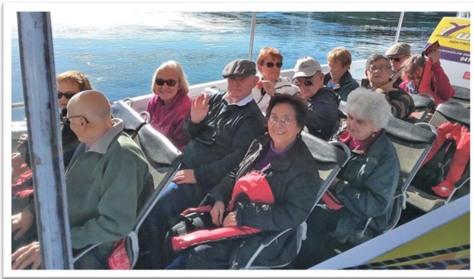
All aboard the speedboat at Narooma

We stayed at Bairnsdale for 4 nights, with wine tasting then lunch the next day at Wyanga Park Winery, and later visited Nyerimilang Park, a National Trust property of fine location and heritage appeal, where we stepped back into life in the 1800's.